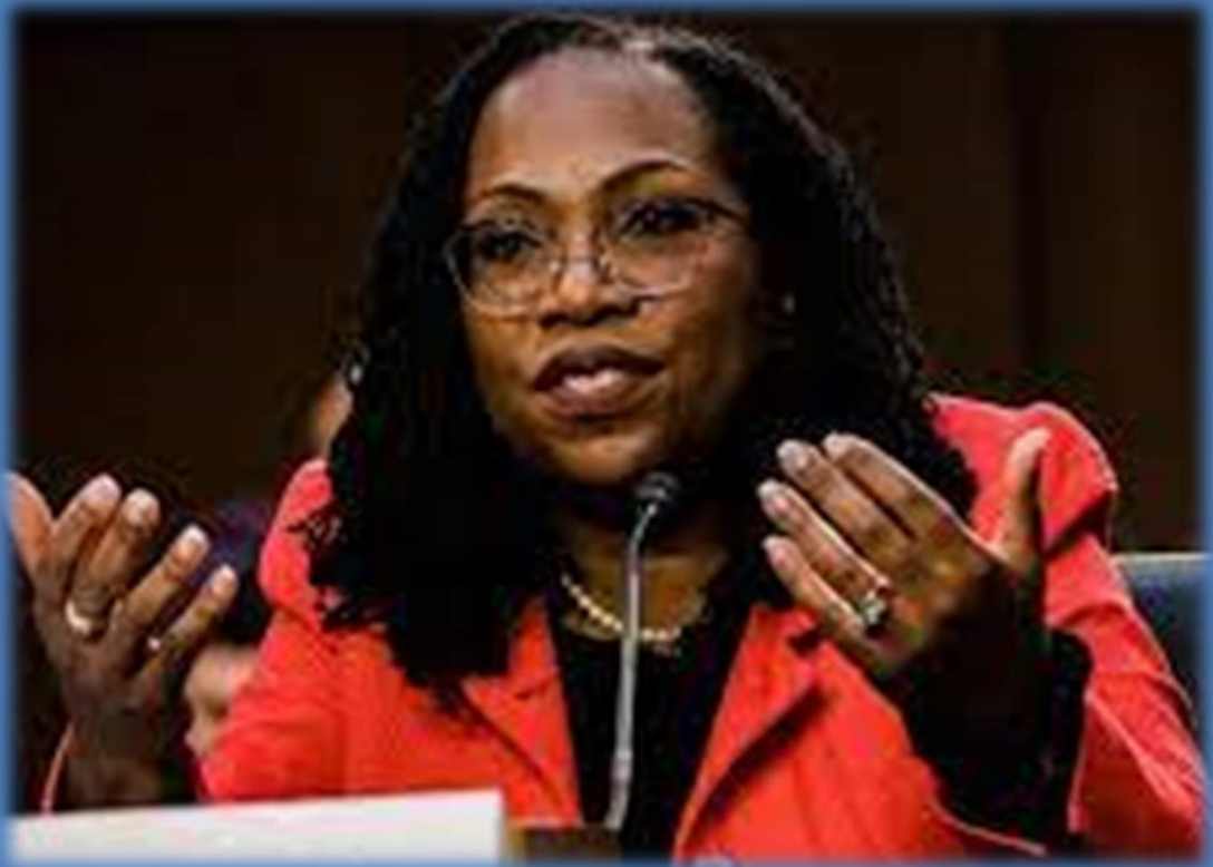
Ketanji Brown Jackson