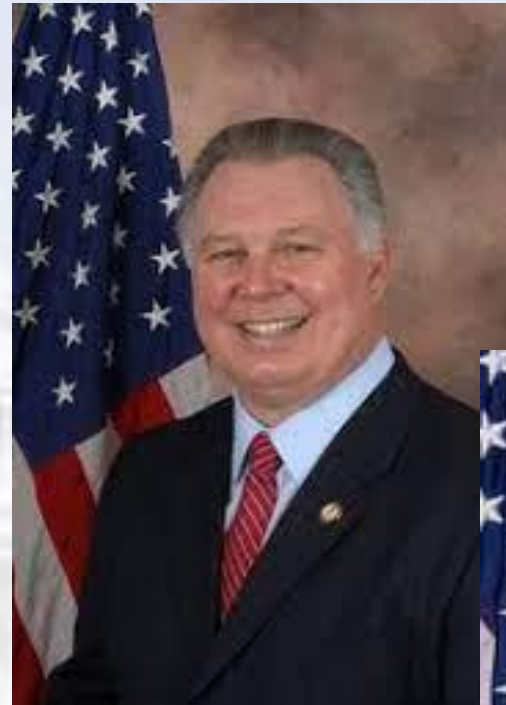
Rep. Albio Sires (D-NJ)