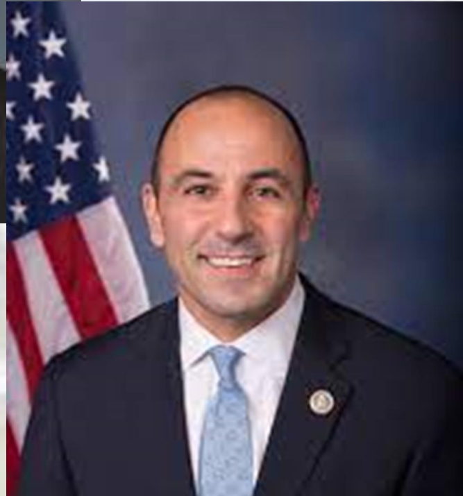
Rep. Jimmy Panetta (D-CA)