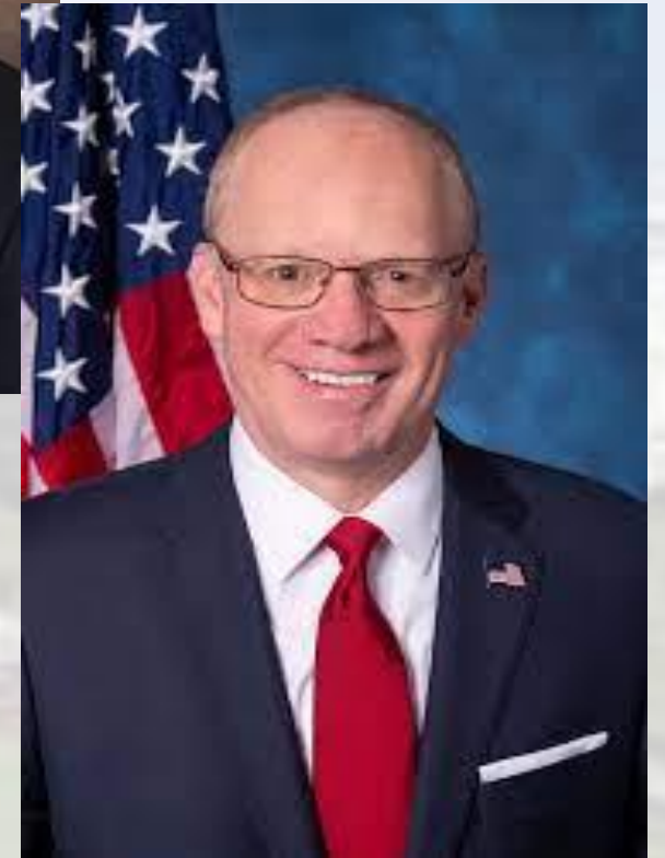
Rep. John Rose (R-TN)