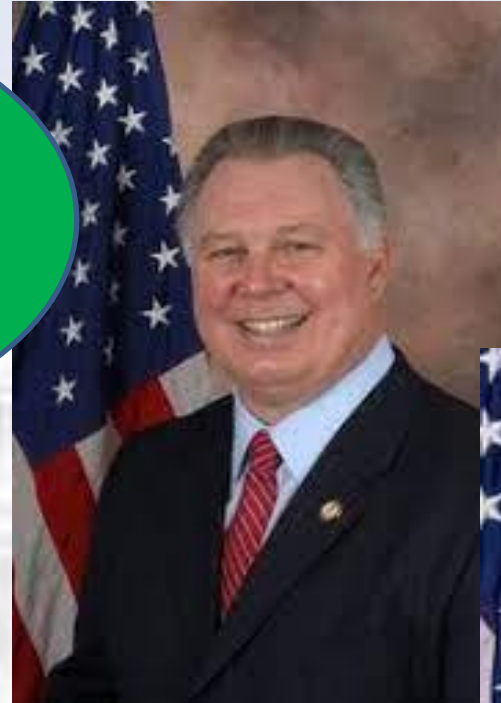
Rep. Albio Sires (D-NJ)