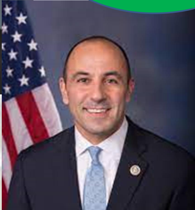
Rep. Jimmy Panetta (D-CA)