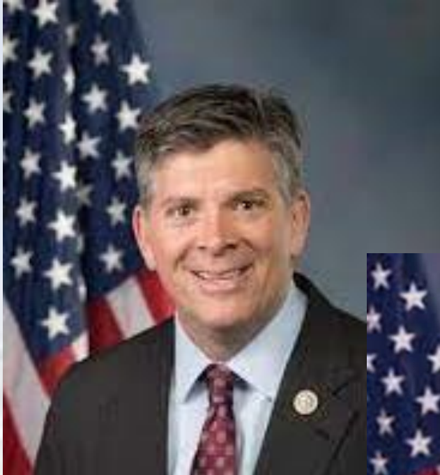
Rep. Darin LaHood (R-IL)