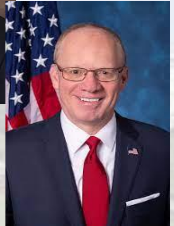
Rep. Max Rose (R-TN)